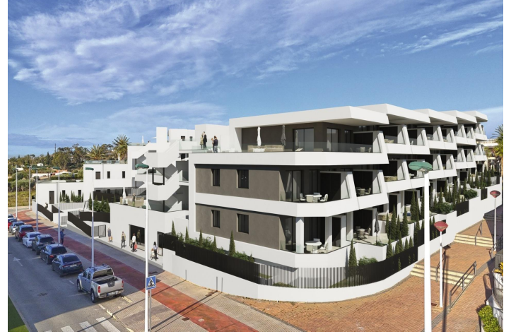
BLOCK 1 - House 18